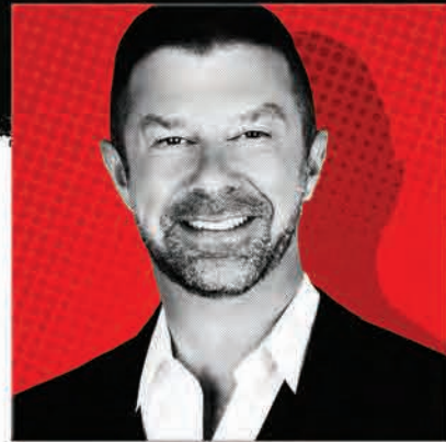
JIM CASEY ARTS AND ACTIVISM AWARD