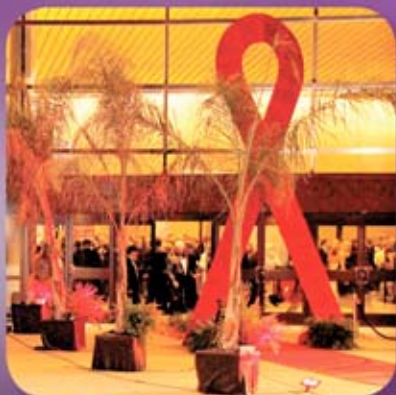
2011 Red Carpet