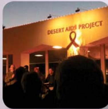
World AIDS Day