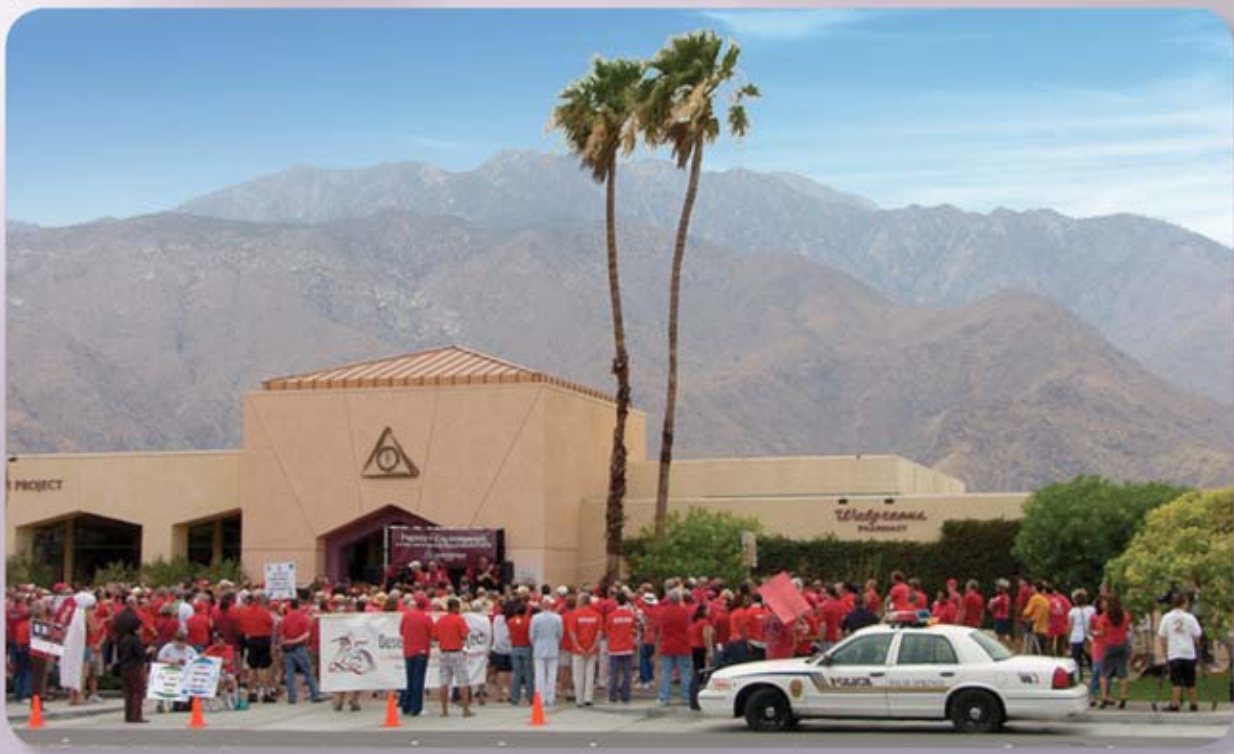
State budget protest when $85 million in AIDS funding was lost statewide