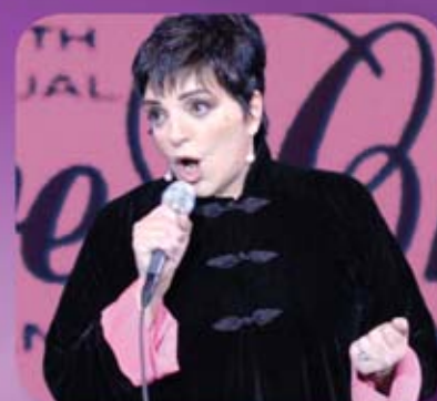
Liza Minnelli, 2007 Arts & Activism Award winner