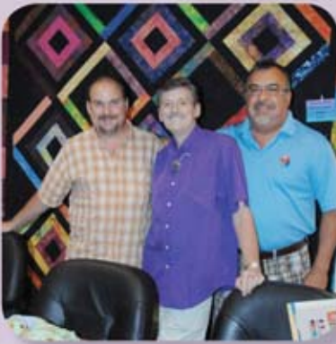
Stitch in Time members show some of their handiwork

Desert AIDS Project has earned a national reputation as a one-of-a-kind AIDS service organization. With an 11,000 square mile service area – roughly the size of the state of Massachusetts – some clients travel from as far away as Blythe on the Arizona border, as well as from the cities, towns and rural areas of San Bernardino, Riverside and Imperial Counties.