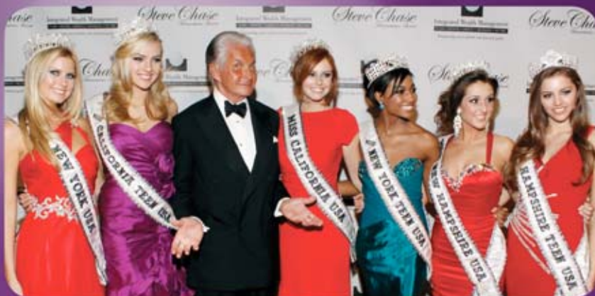
Beauty queens ... and George Hamilton