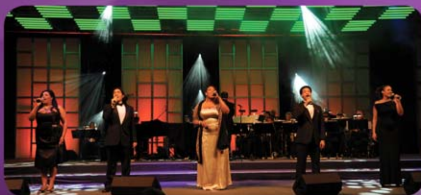
RENT cast members perform