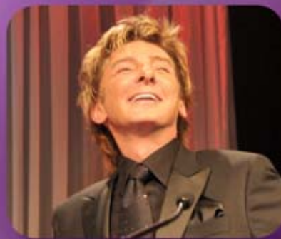
Barry Manilow is named Silver Anniversary Community Service Award winner