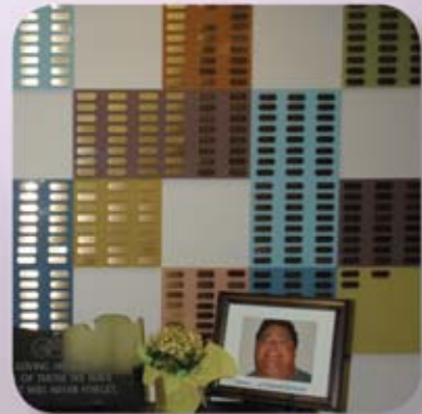
Remembering some who have passed from AIDS