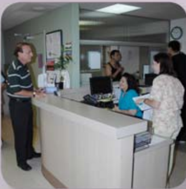
Our busy Wells Fargo HIV Health Center